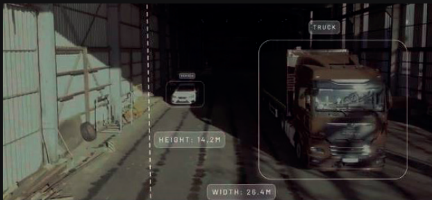
Front Camera View into a Storage Facility Building

By utilizing 3D measurements - shown here using the example of a storage facility - the mapping solution transforms unknown areas into detailed representations of the environment, including paths (drivable and non-drivable), textures, surfaces, ground changes, and irregularities, even in areas where GNSS is unavailable.