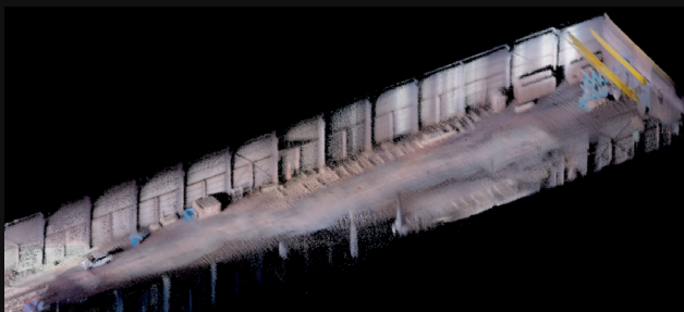
Total View: 3D Map in GNSS-Denied Environment, Colored by Camera RGB Values

By utilizing 3D measurements - shown here using the example of a storage facility - the mapping solution transforms unknown areas into detailed representations of the environment, including paths (drivable and non-drivable), textures, surfaces, ground changes, and irregularities, even in areas where GNSS is unavailable.